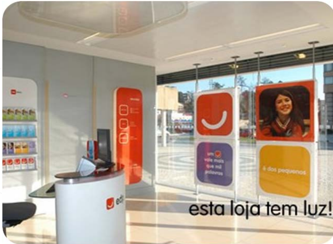
Milan, 20th May 2005