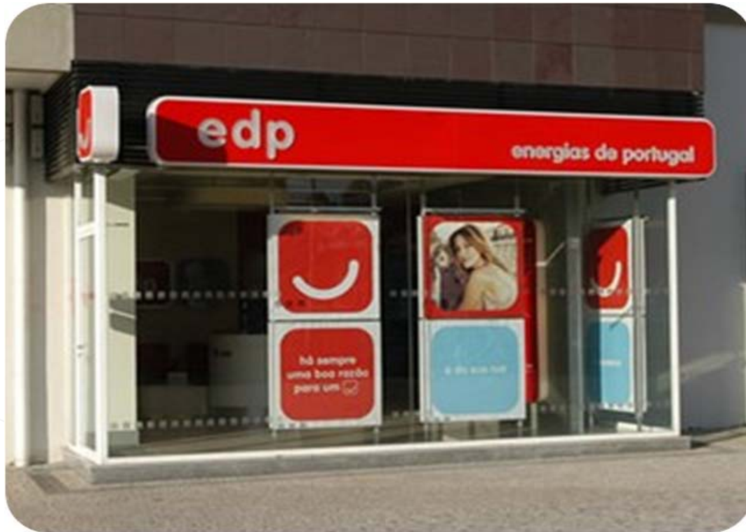
Milan, 20th May 2005