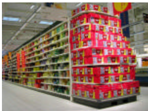
Auchan Longuenesse (F)

GreenLight Partner Super U (France) adopted a new lighting concept using T5 lamps, electronic ballasts and reduced lighting levels. This new concept is 36% more efficient than the installations they used to design. The extra cost will be paid back within ca. 3.5 years.