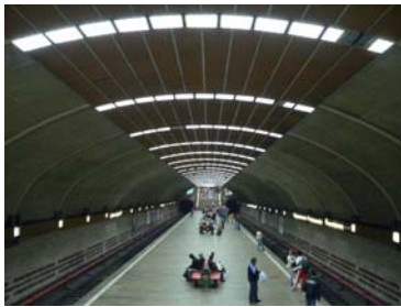
Fig 3 Low consumption lighting system in subway station "Titan"

For modernization of interior lighting more than 43 000 luminaries have been replaced totaling more than 93 000 lamps (fig.3). New lamps are 38mm florescent tubes, including magnetic low-lost ballast and aluminized reflectors and CFL self ballasted.